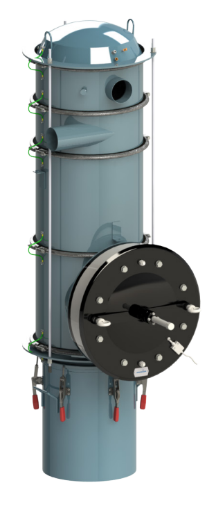
Part No S 11000 EX Part No S11000 EX EVN 420