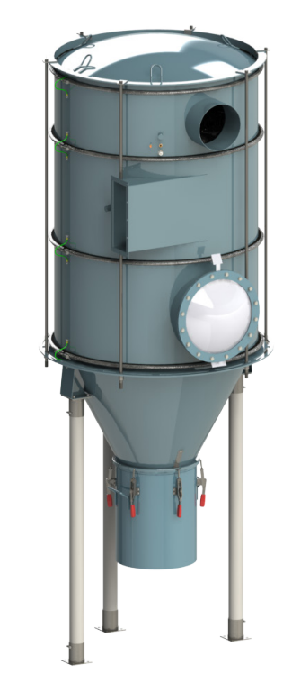
Part No S 34000 EX