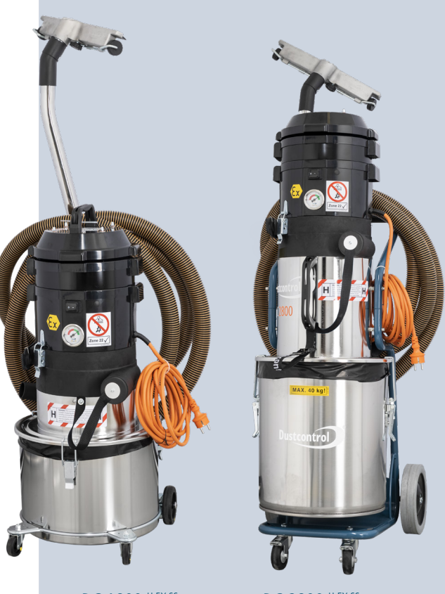
DC 1800 H EX SS