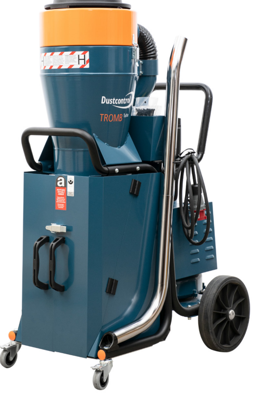
DC Tromb Turbo VFD Asbestos with a container. Part No 176000