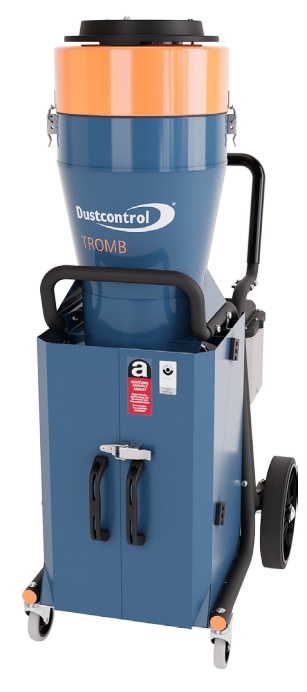
DC Tromb 400 H Asbestos with Intellibag