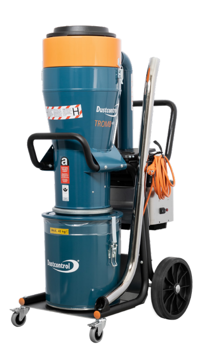
DC Tromb 400 H Asbestos with container

As standard the machine is equipped with a patented self-cleaning filter (washable polyester) and a H13-filter built to be Application Class H. A signal lamp shows when it is time to clean the filter.