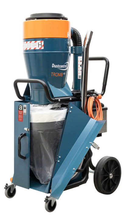
DC Tromb 400 H Asbestos with Longopac