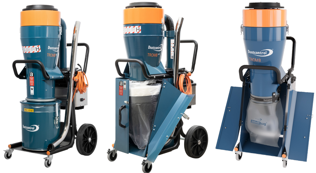
DC Tromb 400 H Asbestos with container

The DC Tromb Asbestos H C/L variants are fitted with a protective enclosure for the safe handling of asbestos waste. This protects the plastic discharge bag or Longopac liner.