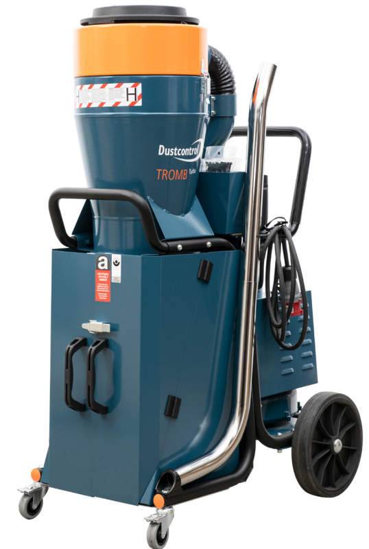
DC Tromb Turbo VFD Asbestos with container Part No 176000