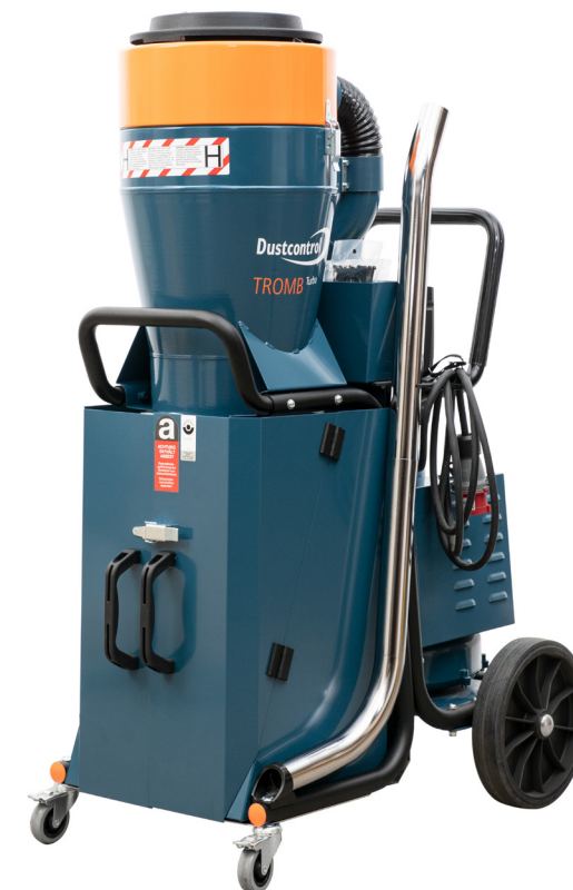
DC Tromb Turbo VFD Asbestos with container Part No 176000